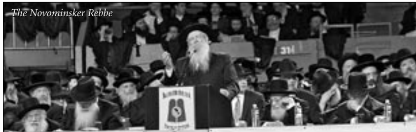
The Novominsker Rebbe