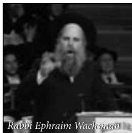
Rabbi Ephraim Wachsman